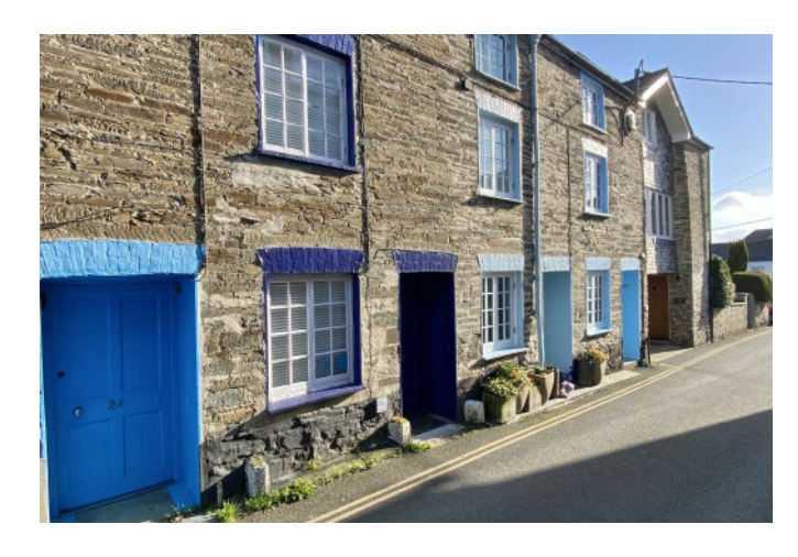
The Sail Loft, Church Lane, Padstow, PL28 8AY

The Sail Loft is currently a well established and successful holiday let which can also come fully furnished. Details are available on request.