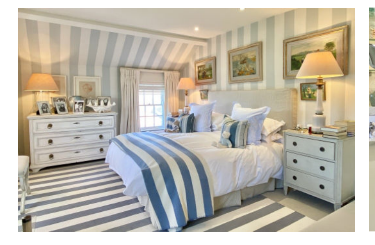
Constantine Cottage Constantine Bay, PL28 8JJ £5,000,000 guide

The L shaped kitchen /dining room follows on from the drawing room and being double aspect, has the sea view and opens via patio doors to the sheltered west facing barbecue patio (with electrically operated awning). A generous space for sofas and a large dining table (it seats 10) is matched by a bespoke fitted kitchen with integral appliances, NEFF ovens, hob, and a large island, complete with warming drawer, and a supersized freestanding fridge freezer. The décor of blue panelling and white details accentuate the fresh, sea inspired colours of the reception rooms.