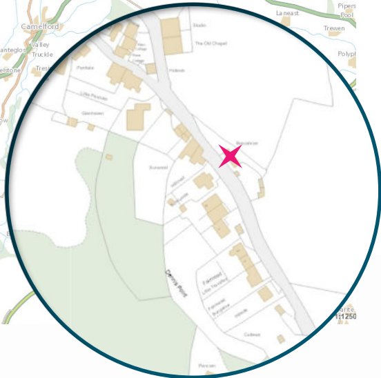
GROUND FLOOR 540 sq.ft. (50.2 sq.m.) approx.

To find Boscabrae, follow the A39 from Wadebridge signposted to Bude. After approximately 7 miles turn left on to the B3267 and drive all the way through St Teath. At the t-junction, turn right onto the B3314 (coast road) signposted to Delabole. Drive through Delabole and continue along this road until you see a sign for Tintagel. Turn left here and join the B3263 and drive for approximately 2.5 miles towards Trewarmett. Enter the hamlet of Trewarmett and continue up the hill. Boscabrae can be found on the right hand side on the brow of the hill. The postcode for satellite navigation is PL34 0ET. What3words: trifling.building.backtrack