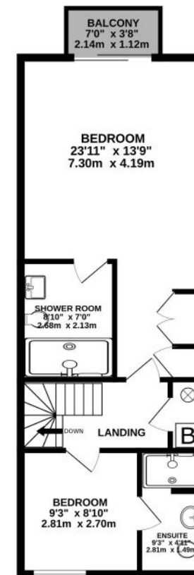
TOTAL FLOOR AREA: 1051 sq.ft. (97.6 sq.m.) approx.